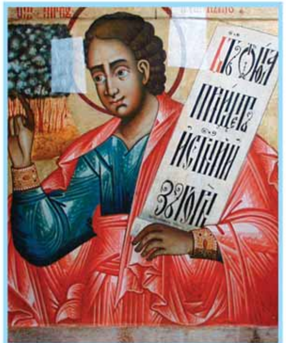
8. HABAKKUK (Habacuc)