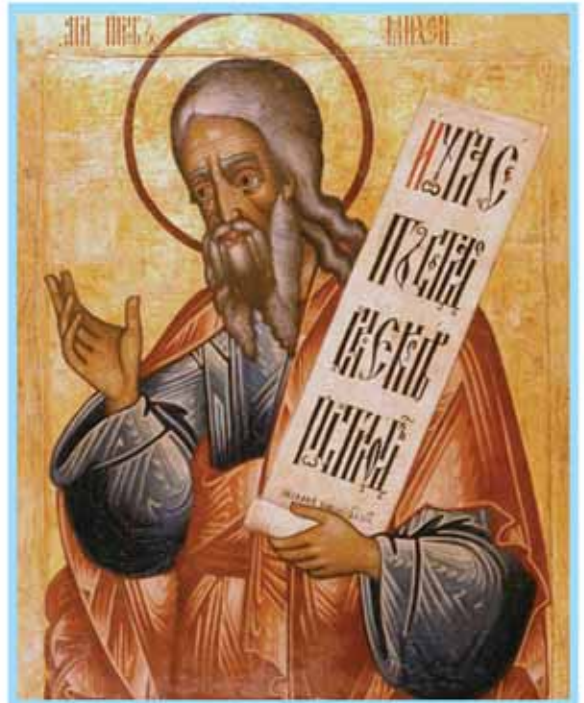
6. MICAH (Michaels)