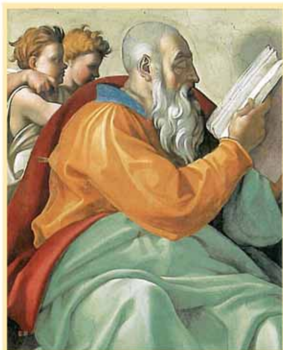
11. ZECHARIAH (Zacharias)