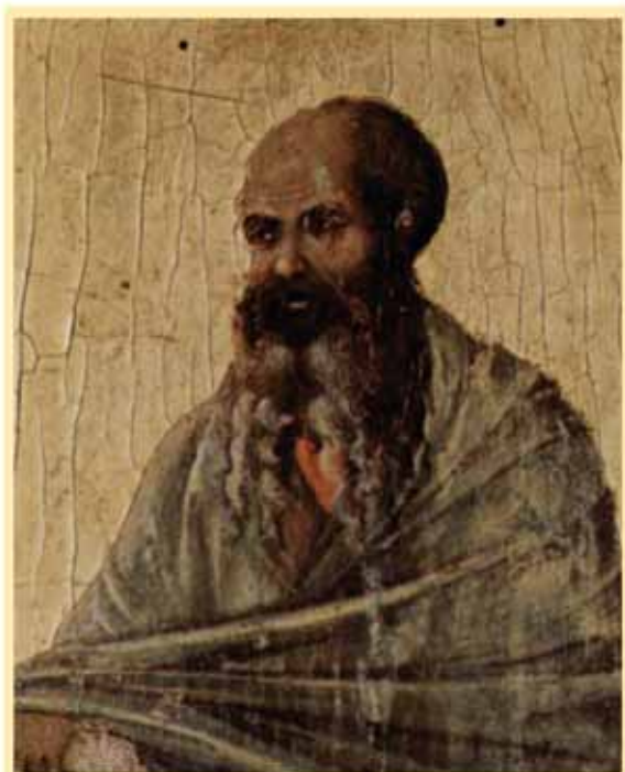
12. MALACHI (Malachias)