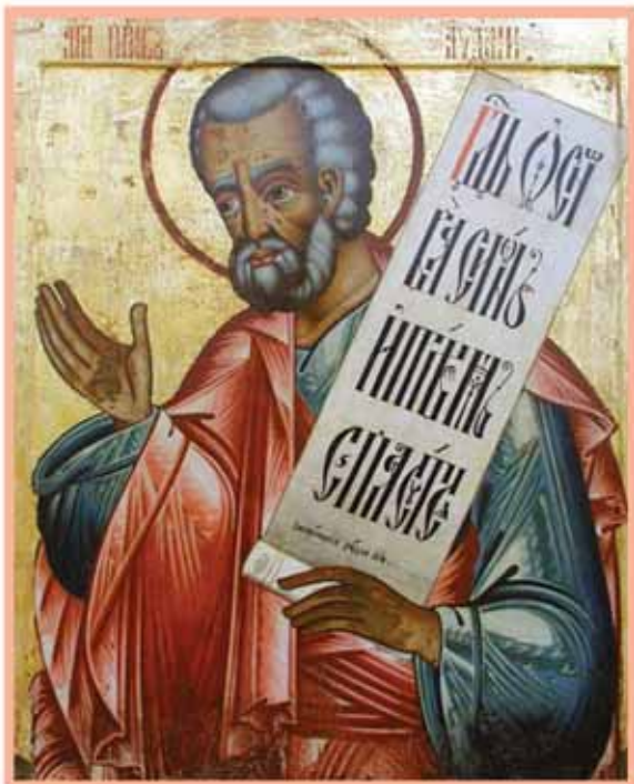
4. OBADIAH (Abdias)