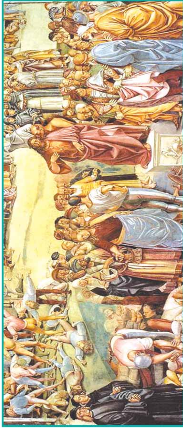
ANTI - CHRIST