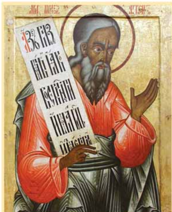
10. HAGGAI (Aggeas)