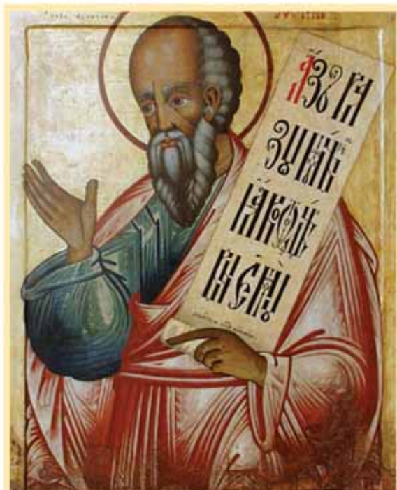
9. ZEPHANIAH (Sophonius)