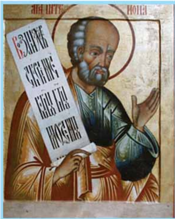
5. JONAH (Jonas)